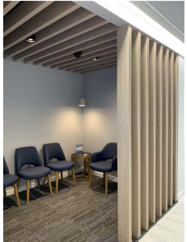
QLD X-Ray Bowen Hills Vertical & Ceiling Beams