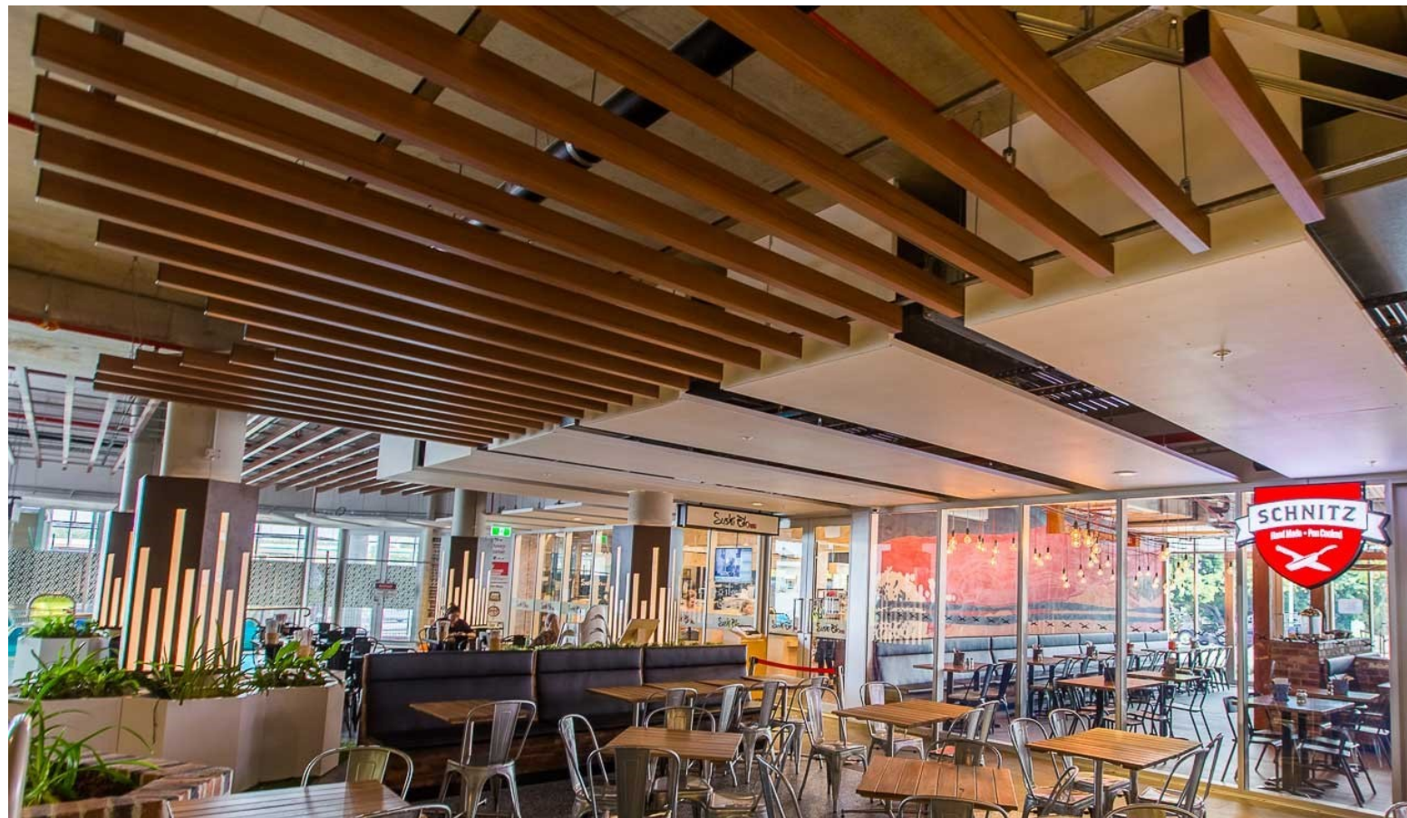
Newmarket Village Food court area. Digitally printed aluminium beams in Heritage Walnut.