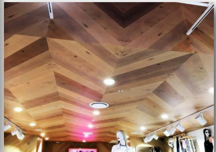
Group 2 FR MDF substrate with Chevron timber