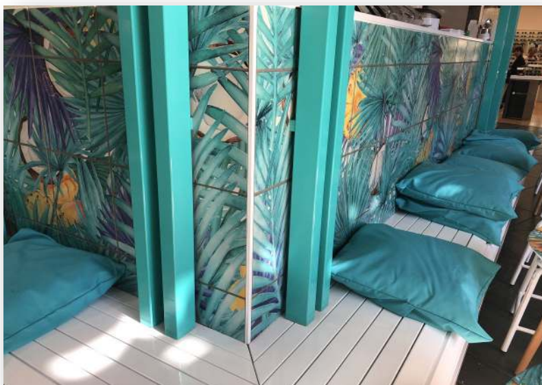
Custom Tiles on CFC with DP

Gen-Eco's Creative Imagery process can utilise the following formats: