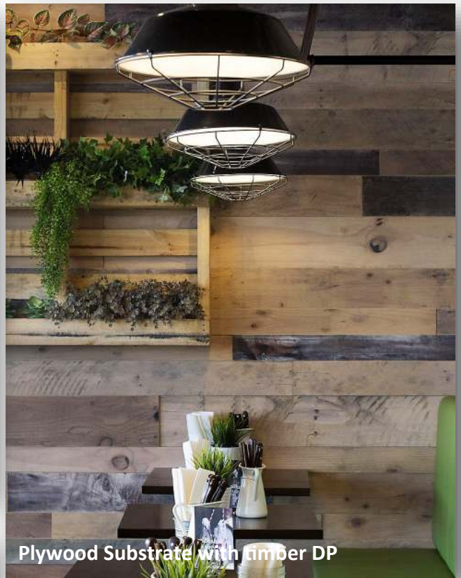
Plywood Substrate with timber DP