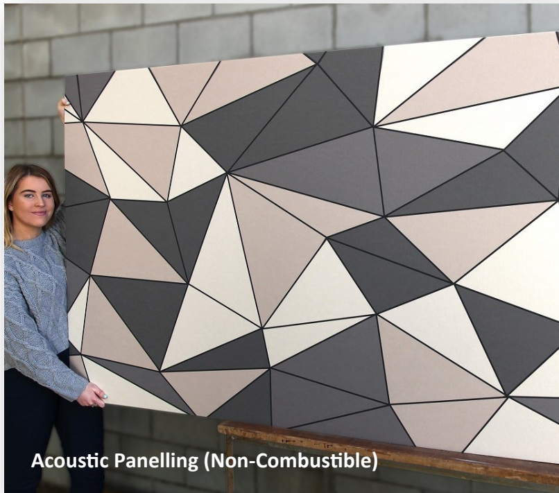
Acoustic Panelling (Non-Combustible)