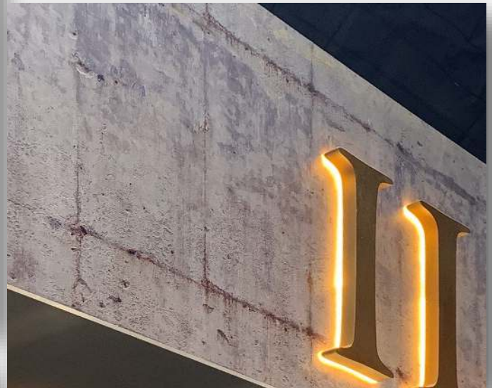
Concrete DP on MDF panels