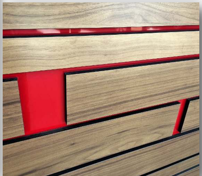
Black core Foamboard with Walnut DP