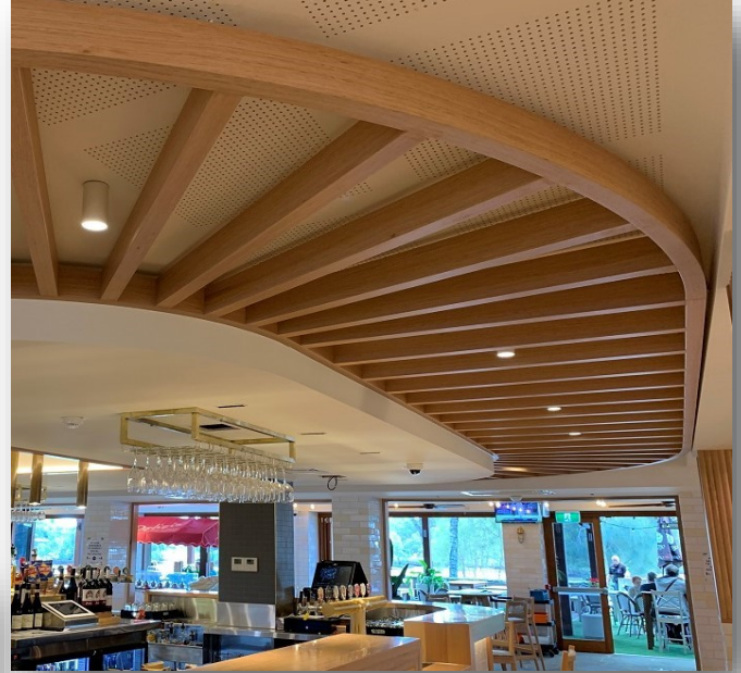
Ecolite Beams produced from Balsa/MDF core