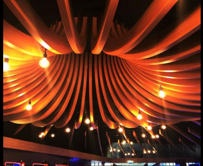
Gen-Ecolite Beams produced from Balsa/MDF