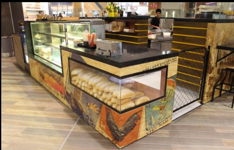
Oriented Strand Board