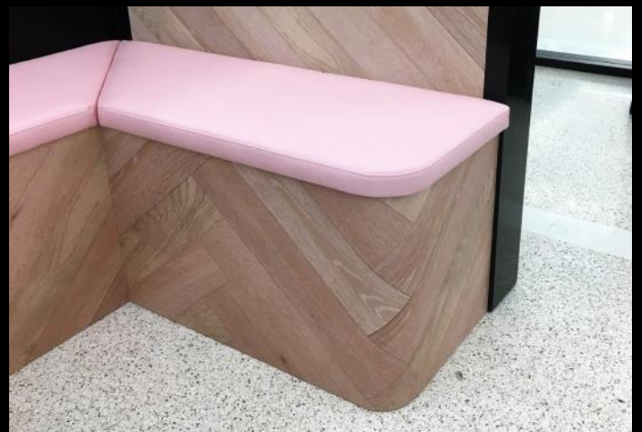
Laminate (can be curved)