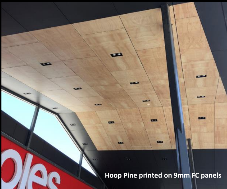
Hoop Pine printed on 9mm FC panels