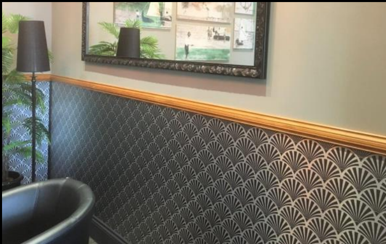
Brushed Aluminium ACM