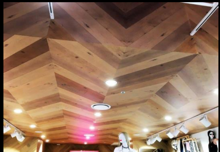
Fire Retardant MDF