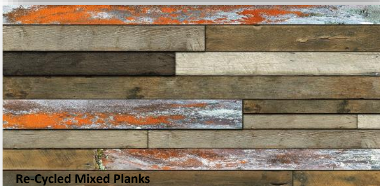
Re-Cycled Mixed Planks