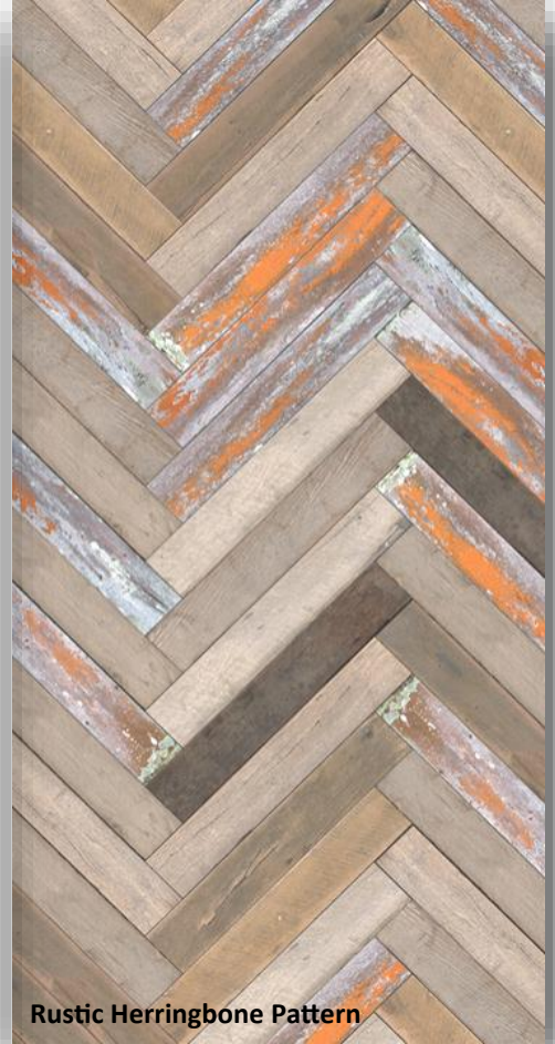
Rustic Herringbone Pattern