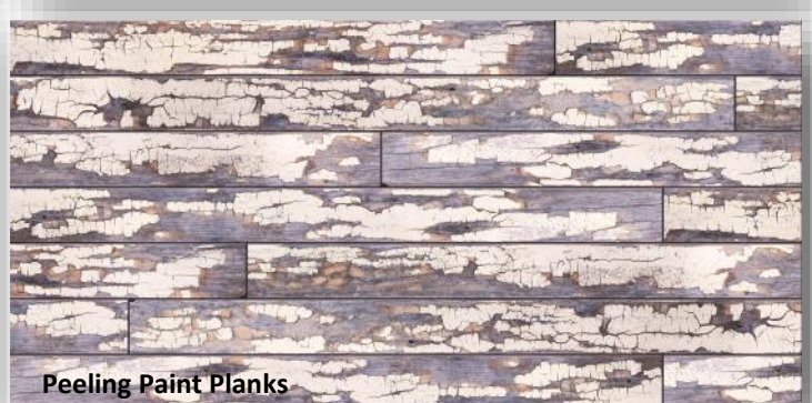
Peeling Paint Planks