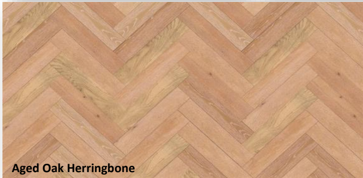
Aged Oak Herringbone