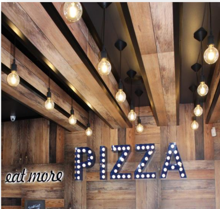
Mosaic Pizza Loganholme QLD Re-cycled timber planks printed onto CD grade plywood. Designer - Clui Design West End