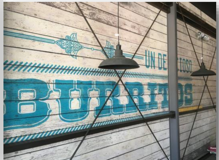
Burrito Bar—Banyo QLD. Whitewashed woodgrain and logo direct printed onto CD grade plywood. Veca Design Toowong