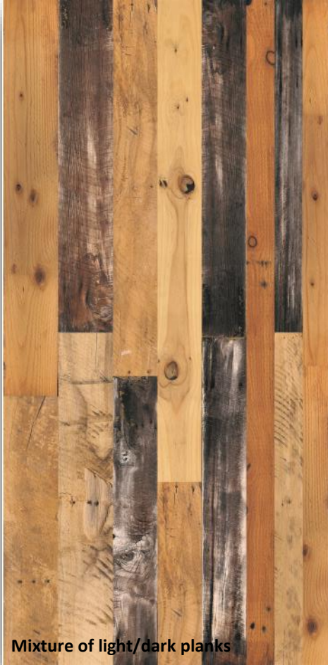
Mixture of light/dark planks