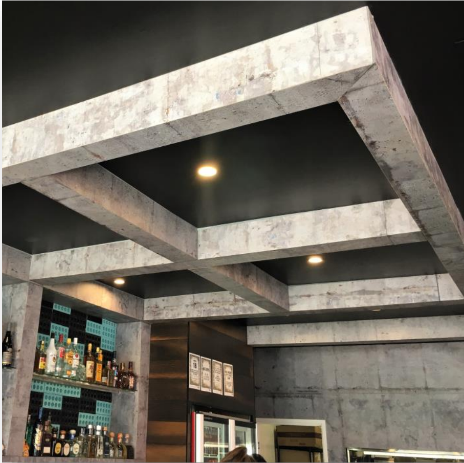
Box beams made with Balsa/MDF core. Burrito Bar—Holmview

The combination of Gen-Eco Balsa core and Rawinkk digital printing are producing some exciting results with concrete beams and wall/ceiling panels.