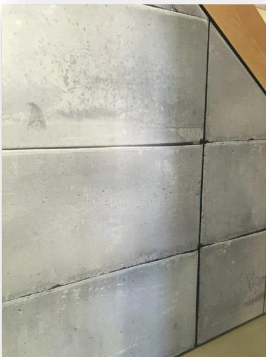
Stairwell enclosure—large blocks printed on 16mm MDF