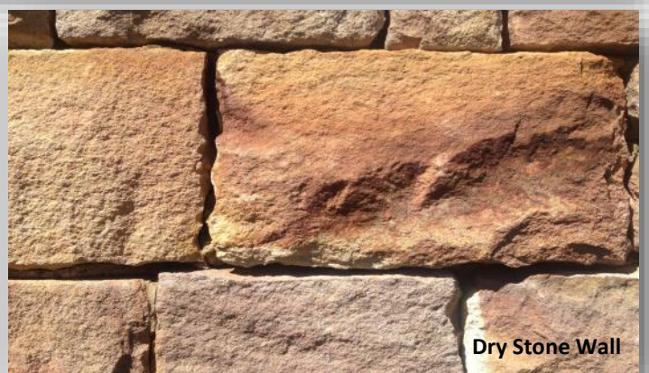
Dry Stone Wall