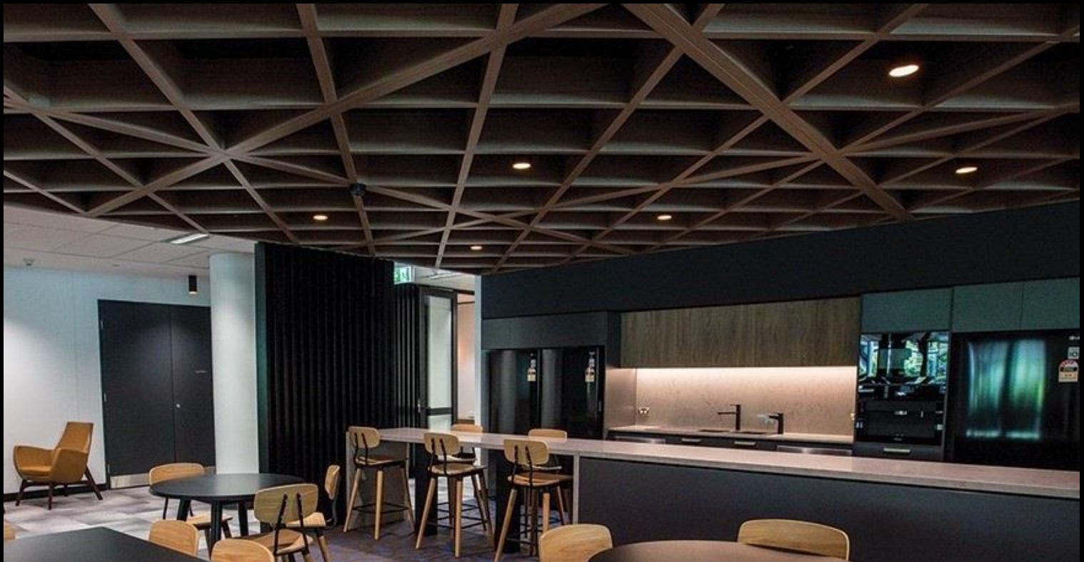
Theiss Head Office—Southbank Brisbane

With lightweight Balsa as the core material, Ecolite beams have distinct advantages in installation costs and the ability to create interesting profiles.