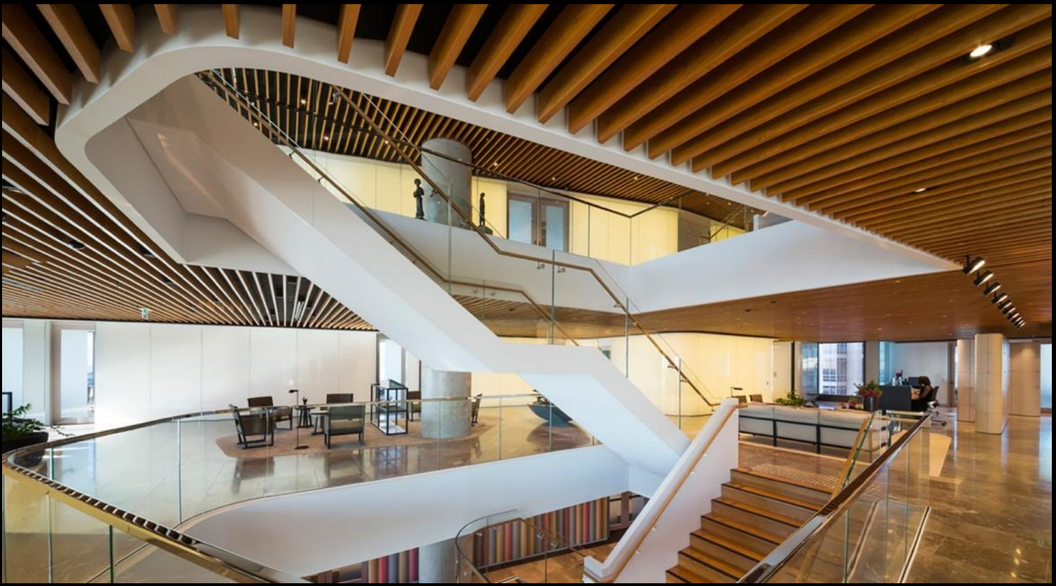
Herbert Smith Freehills Law Firm—Sydney

Our Ecolite beams and panels have been installed in many corporate offices across Australia. The Ecolite beams can be applied with many surfaces including digital print, natural timber veneer, laminate and paint.