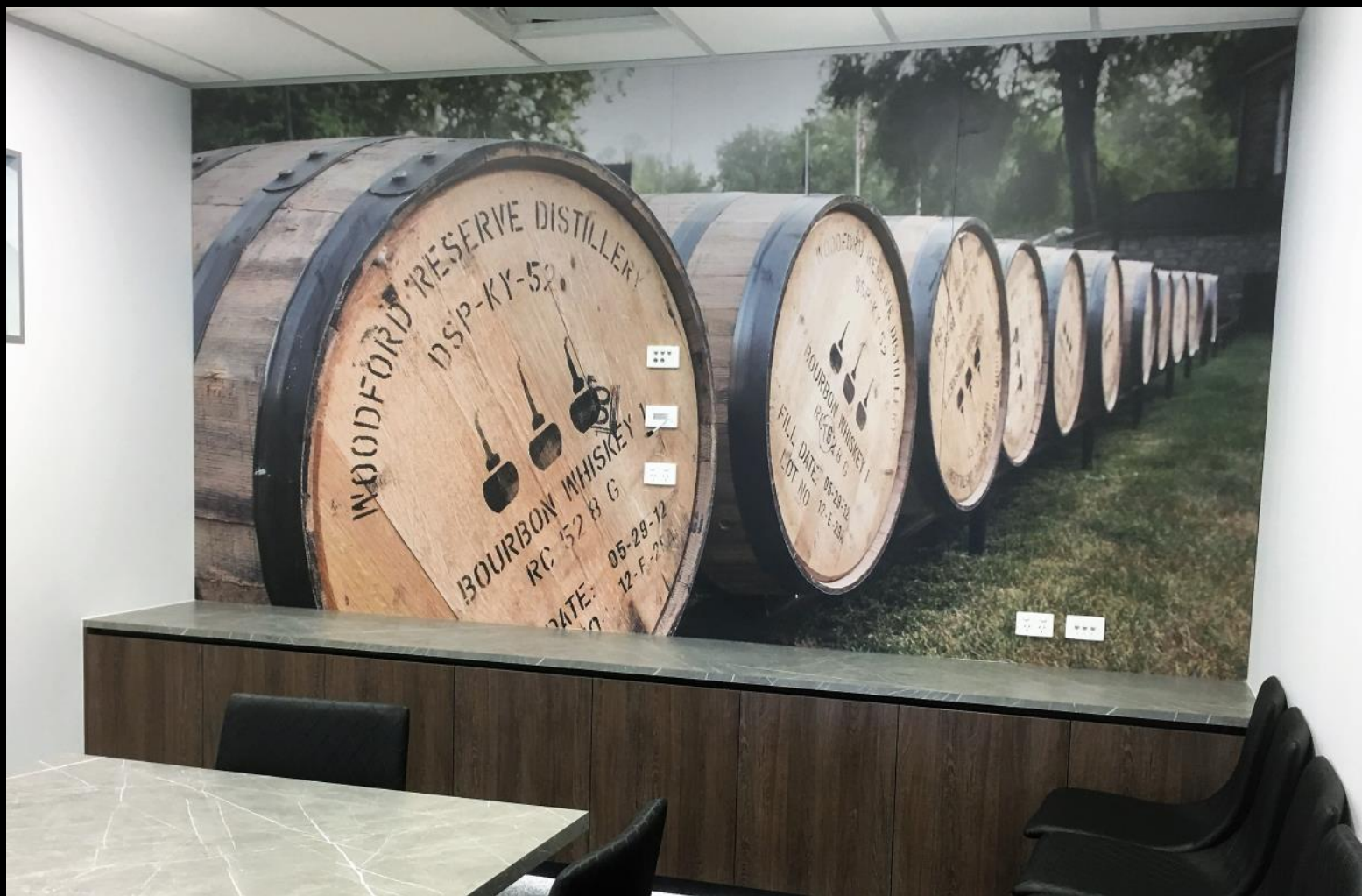
Brown Forman Offices—Brisbane Designer/Builder: Priority Design & Construction Corporate images digitally printed on MDF panels