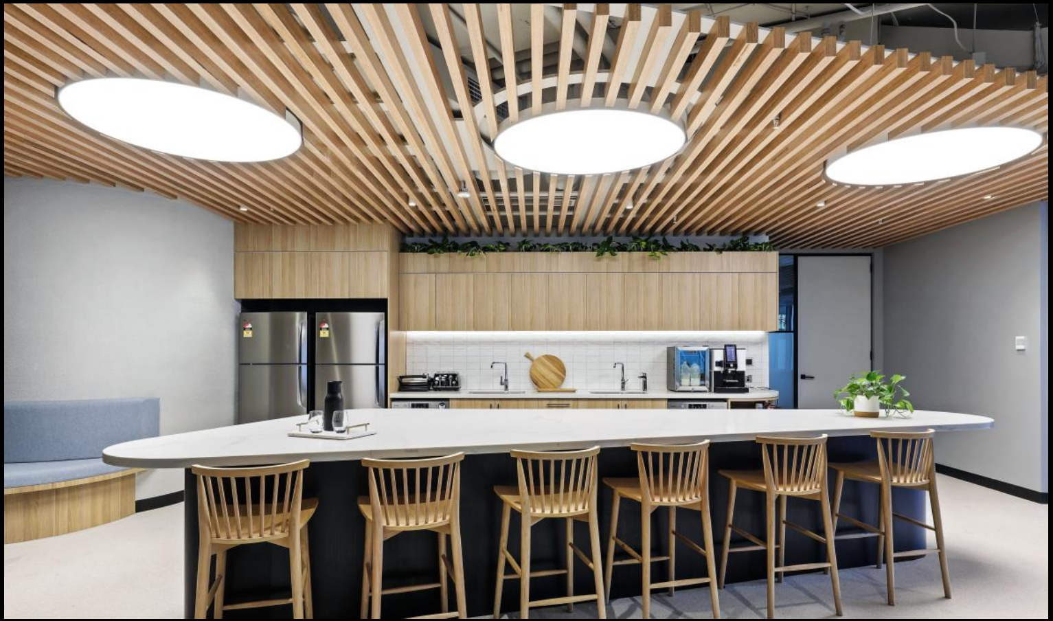
Scottish Pacific Offices—Sydney Shopfitter: Woodland Shopfitting Product: Ecolite beams digitally printed with Spotted Gum