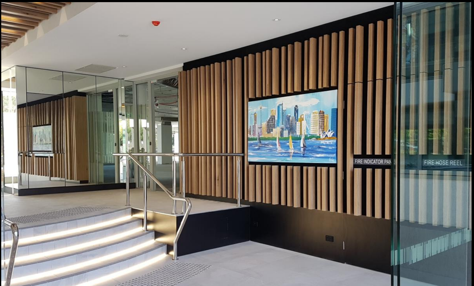
Corporate House—Pymble Place, Sydney Architect: Architects Dovey Product: Ecolite bateens with Spotted Gum digital print