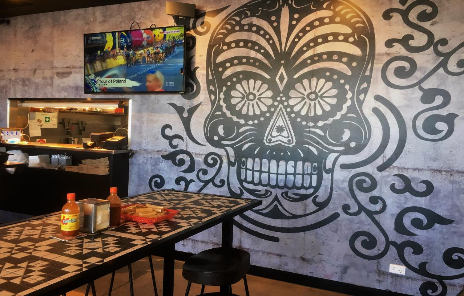
Burrito Bar—Perigian Springs QLD Designer: Blackbox Retail Design Shopfitter: Farrago Interiors Product: Concrete imagery on MDF panels which included the 'skull' graphic—another cost saving.