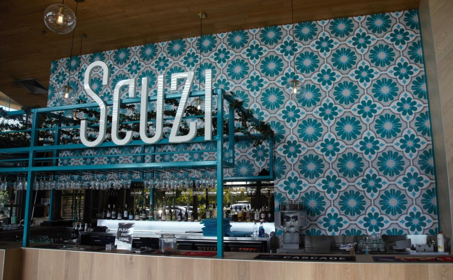
Scuzi Café—Westfield Chermside QLD Designer: Clui Design Shopfitter: Building in Green