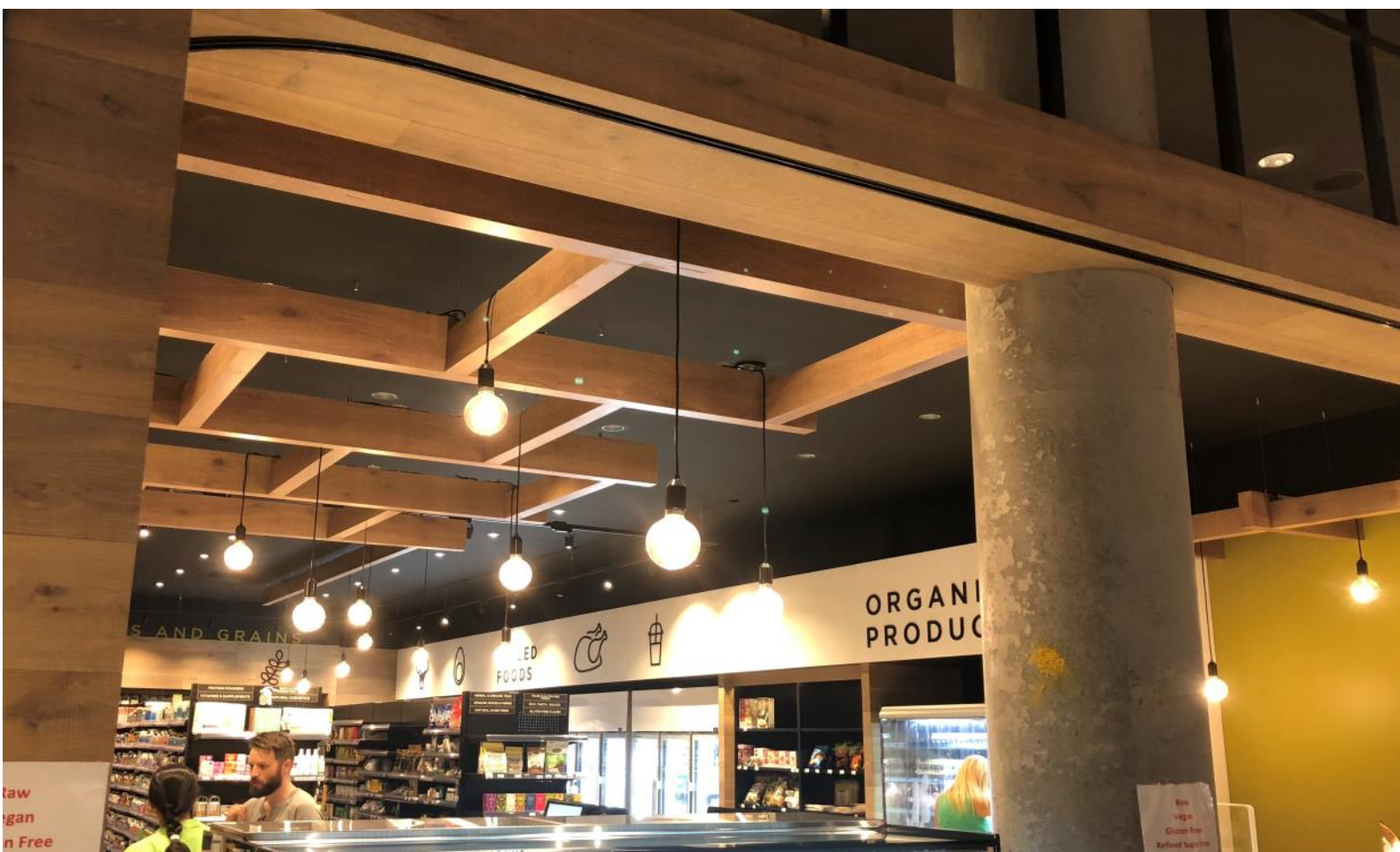
Kiaan Health Foods—Westfield Coomera QLD Shopfitter: Woodland Shopfitting Product: 75mm Ecolite Beams with Rough Sawn Oak imagery