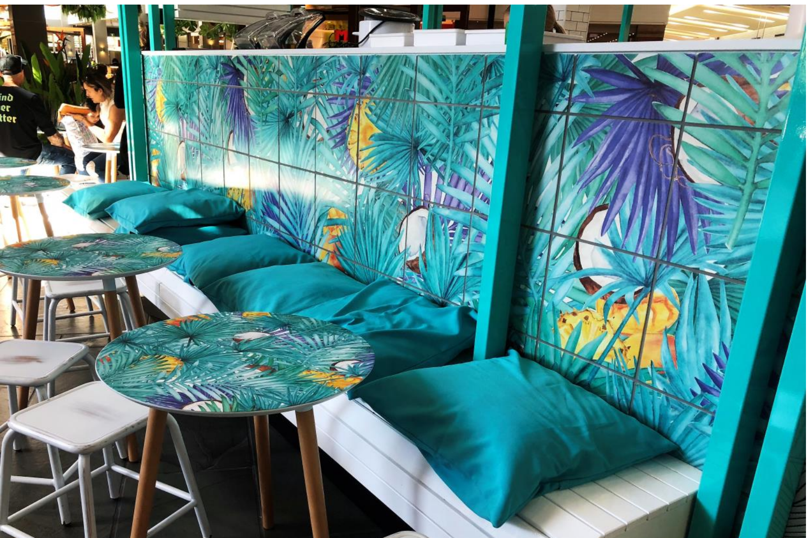
COCOBLISS—North Lakes QLD Designer: Blackbox Retail Design Shopfitter: Fix It Up Product: Cocobliss corporate graphic imagery on Fibre Cement cut into tiles sizes