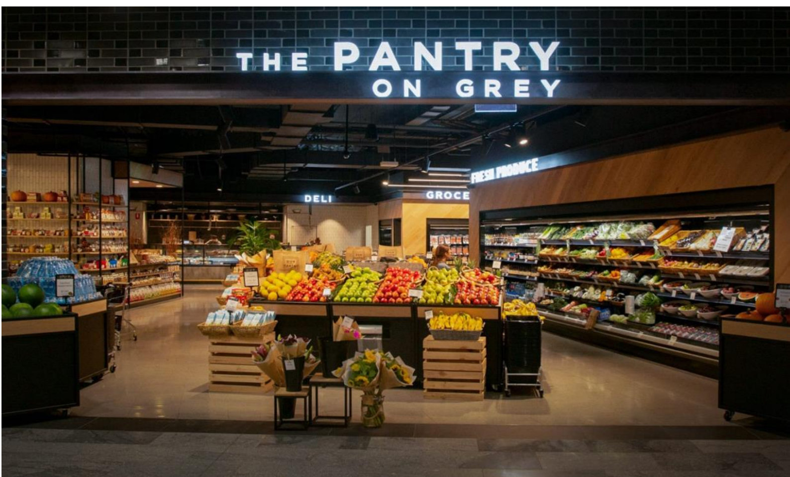
Pantry On Grey—Southbank QLD Designer: Clui Design Product: Metallic steel imagery on MDF and machined into a C shape beam