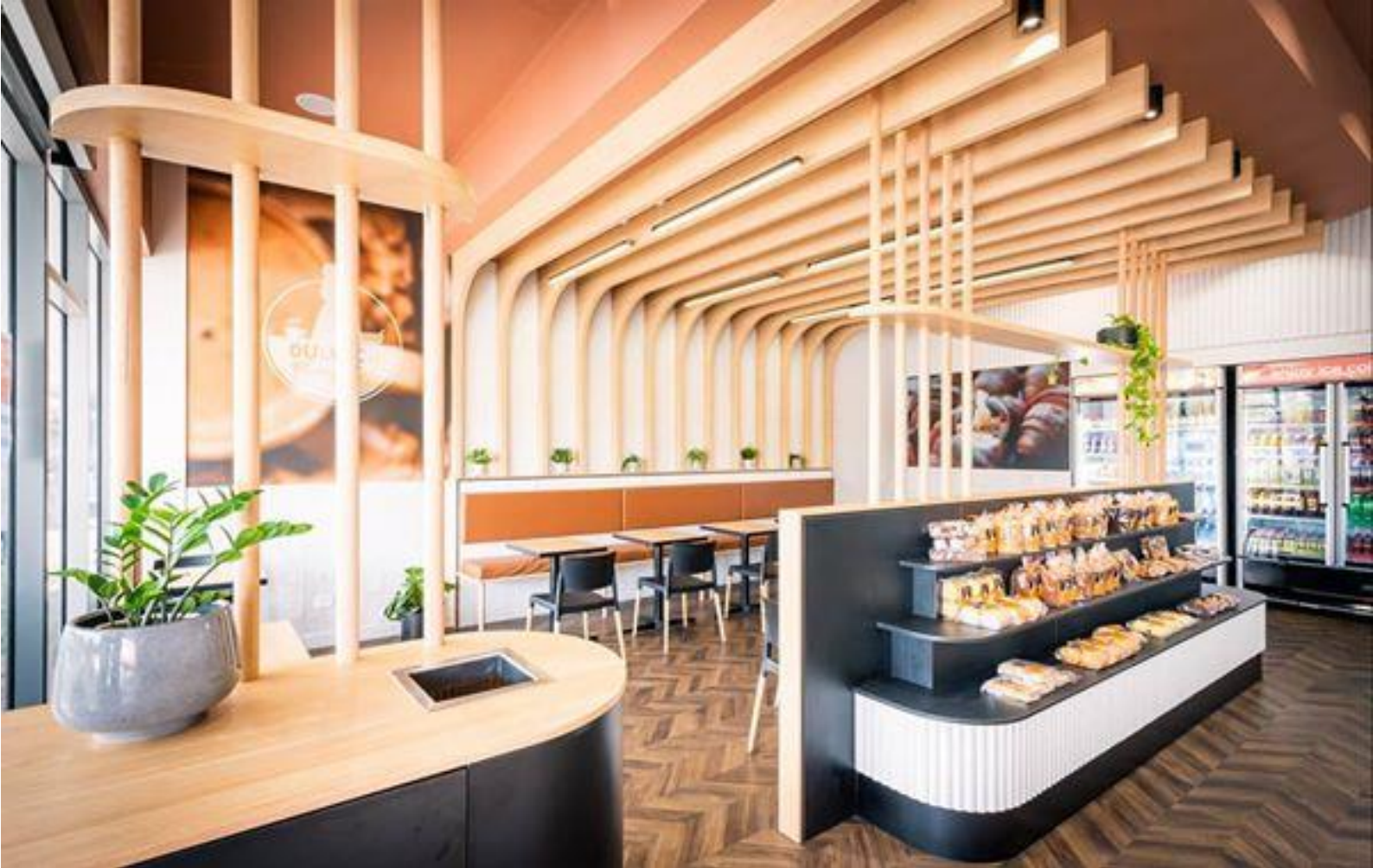
Dulwich Bakery—Mt Barker SA Designer: Hosking Interior Design Shopfitter: Creative Commercial Interiors Product: ECONO beams with Tasmanian Oak decor overlay This project is featured on the front cover