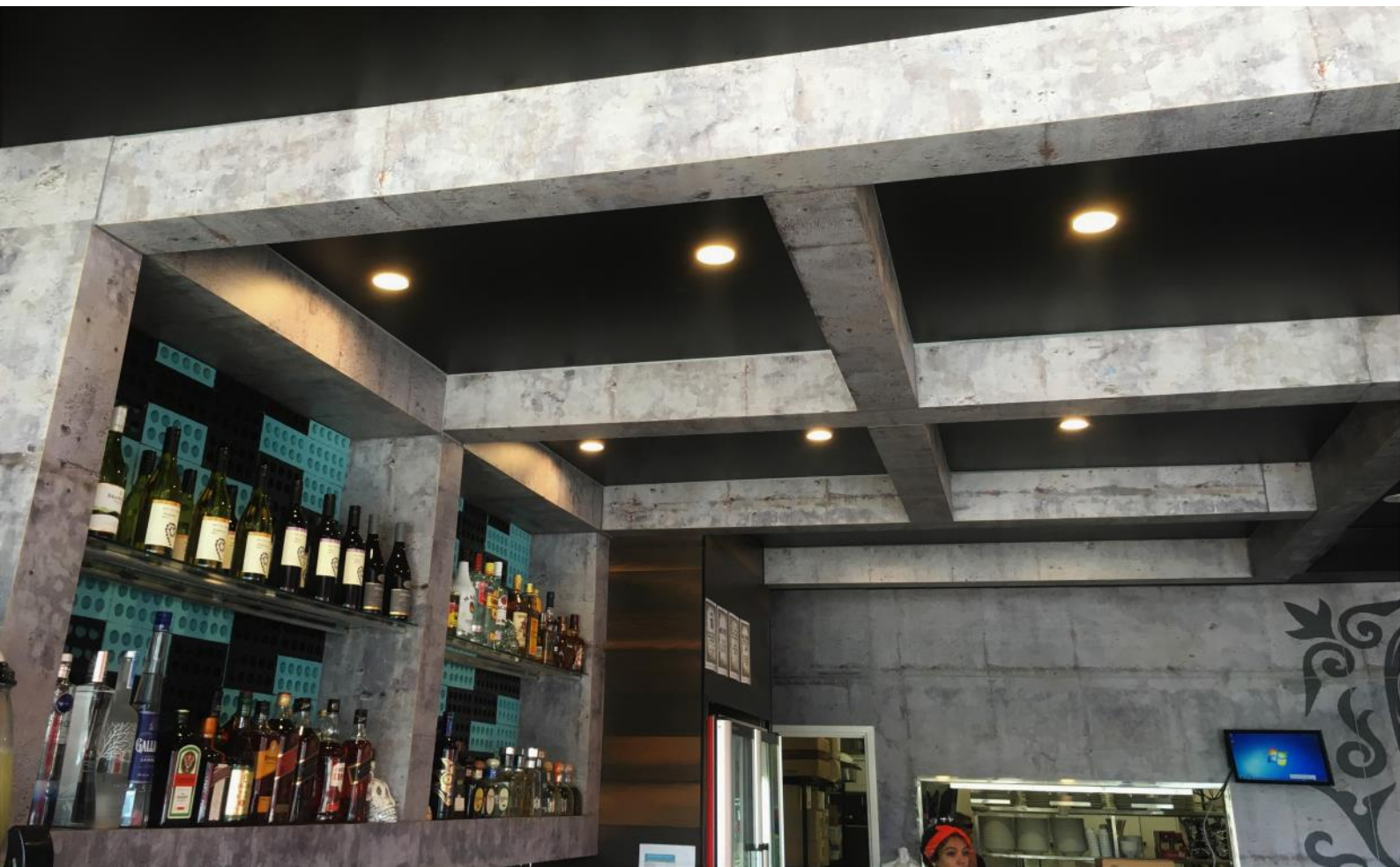
Burrito Bar—Holmview QLD Designer: Blackbox Retail Design Shopfitter: Fix It Up Product: Ecolite hollow box beams with concrete imagery—the look without the cost