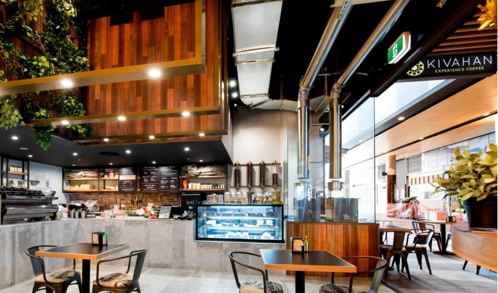
Kivahan Coffee—Coorparoo Square QLD Designer: Blackbox Retail Design Shopfitter: Building In Green Product: Overhead bulkhead panels on MDF to match existing solid timber counter-front